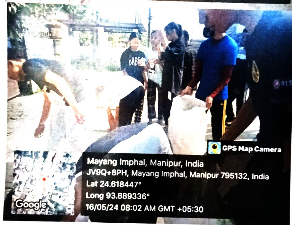
Co-ordinator, IQAC Pravabati College Mayang Imphal